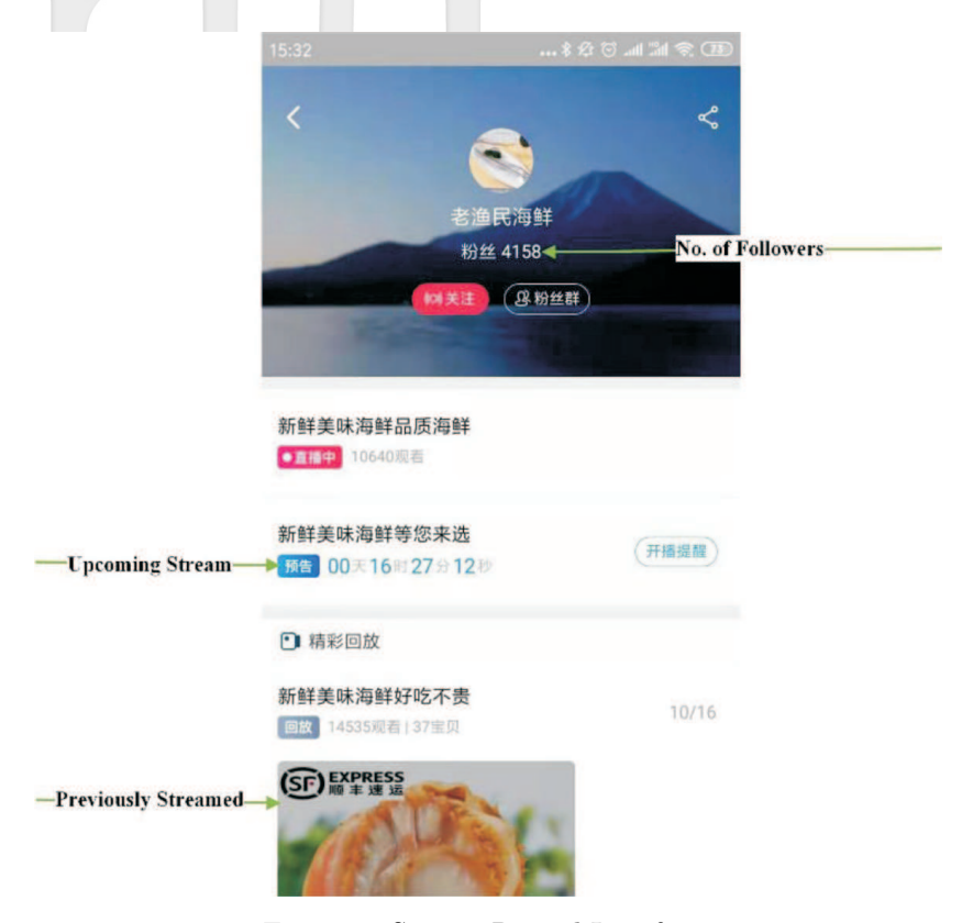
Figure 3: Stream-Record Interface.

an order. To validate our findings and for generalization, we further collected data from a similar B2C/C2C LS platform known as JingDong (JD) with the same time frame (prime time) following all the rules applied to the initial data gathered from Taobao LS platform. JingDong is the third largest B2C/C2C Internet Company worldwide and the leading B2C/C2C online retailer in China (see Globe Newswire [15], and Ji-Yue [24]).