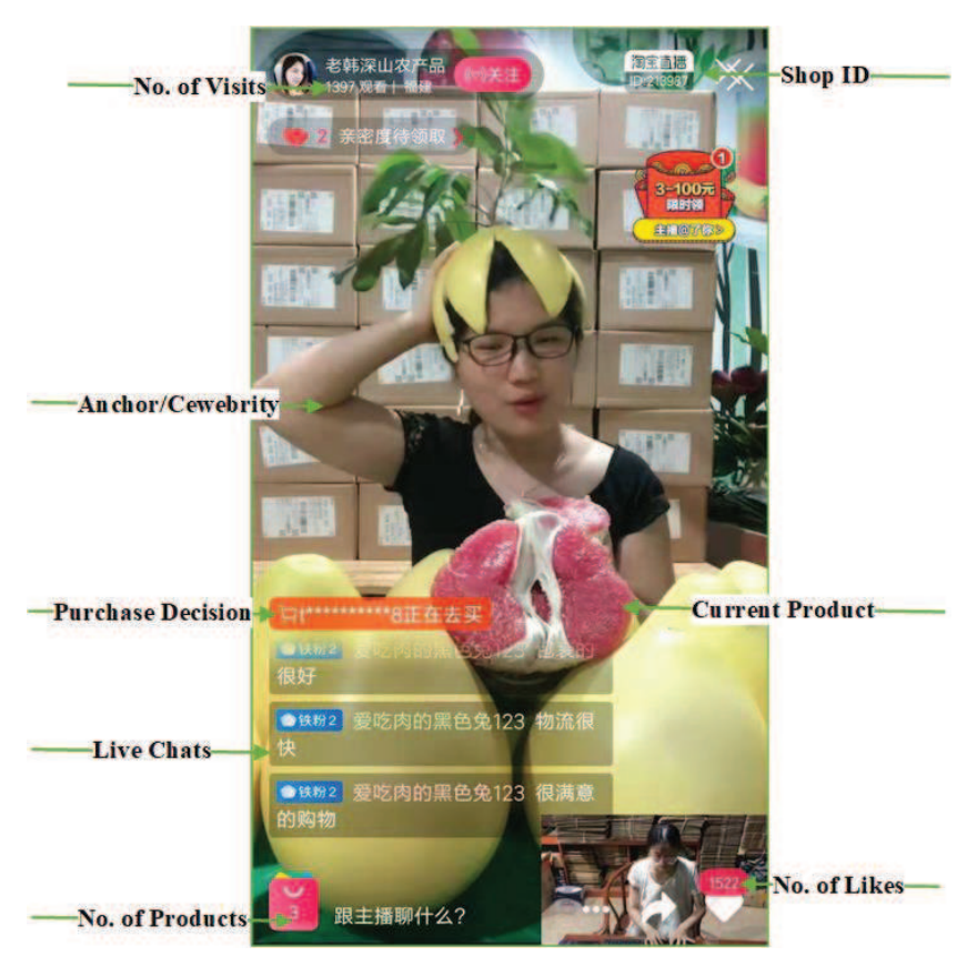
Figure 2: Customer Interactive Interface.

We gathered a total of 498 datasets from Taobao (273) and JD (225) mobile LS platforms. Data were collected between the hours of 20:00 to 22:00 (+8GMT) noted as the prime time in January, April, and July covering Winter, Spring, and Summer. Taobao and JD are few adopters of LS for product experience that adopted LS. It is on record that more than 150 thousand live-broadcasters stream-live on Taobao (see iiMedia Research Group [22]). Half of the viewers are also said to be post-90s borns. An indication of the involvement of a youthful generation in green and sustainable lifestyles. The live broadcast industry is mainly maternal and child, beauty, food, sports, and fitness. More than 1,000 cewebrities have used Taobao LS to broadcast live shows and do e-commerce. Each night from 20:00 to 22:00 (primetime), is not only the most active time to watch the live broadcast but also the time when users are most willing to place