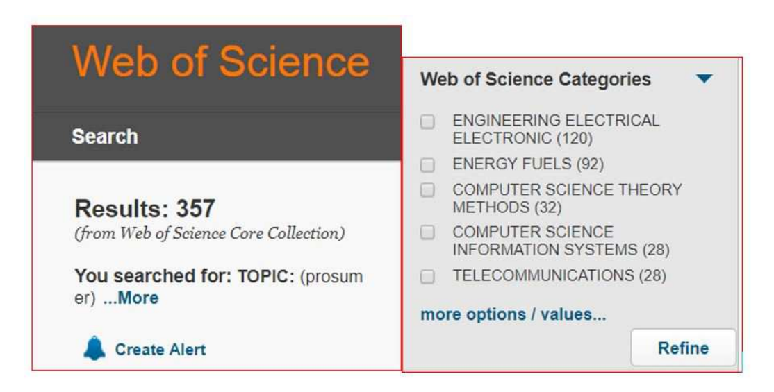
Figure 1: Prosumer literature analysis in web of science (WOS).